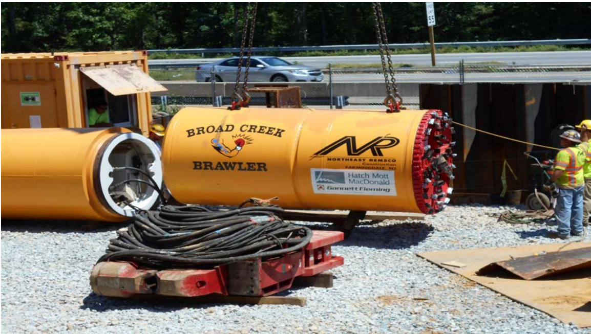
Micro Tunnel Boring Machine (MTBM) for pipeline along MD 210 - south of Swan Creek Road

Construction is ongoing on this contract. The projected substantial completion date is May 30, 2017. This pipeline alignment begins at Swan Creek Road along MD 210(west side) going south and ends at WSSC Piscataway WWTP Plant.