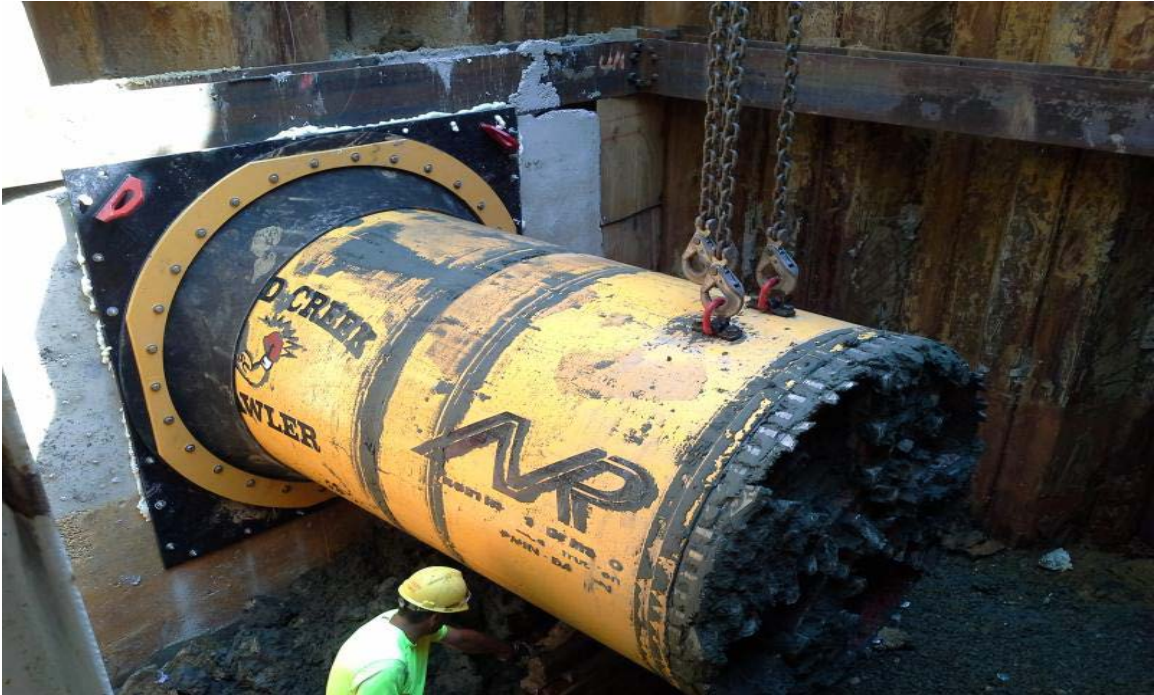
Micro Tunnel Boring Machine (MTBM) being removed after completion of one tunnel for pipeline along MD 210 – south of Old Fort Road