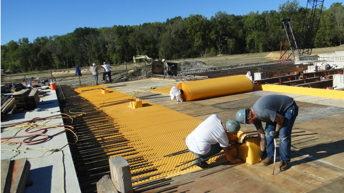
Storage Facility Construction- upper deck