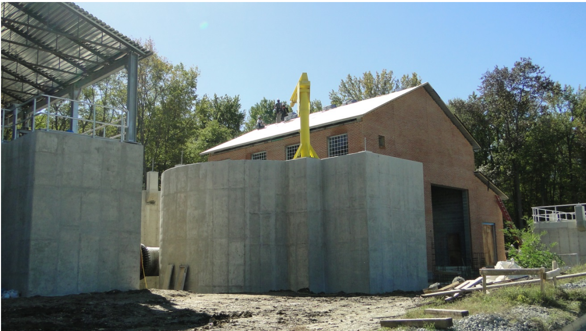
Headworks Facility Construction

Construction is ongoing on this contract. The projected substantial completion date is May 18, 2016.