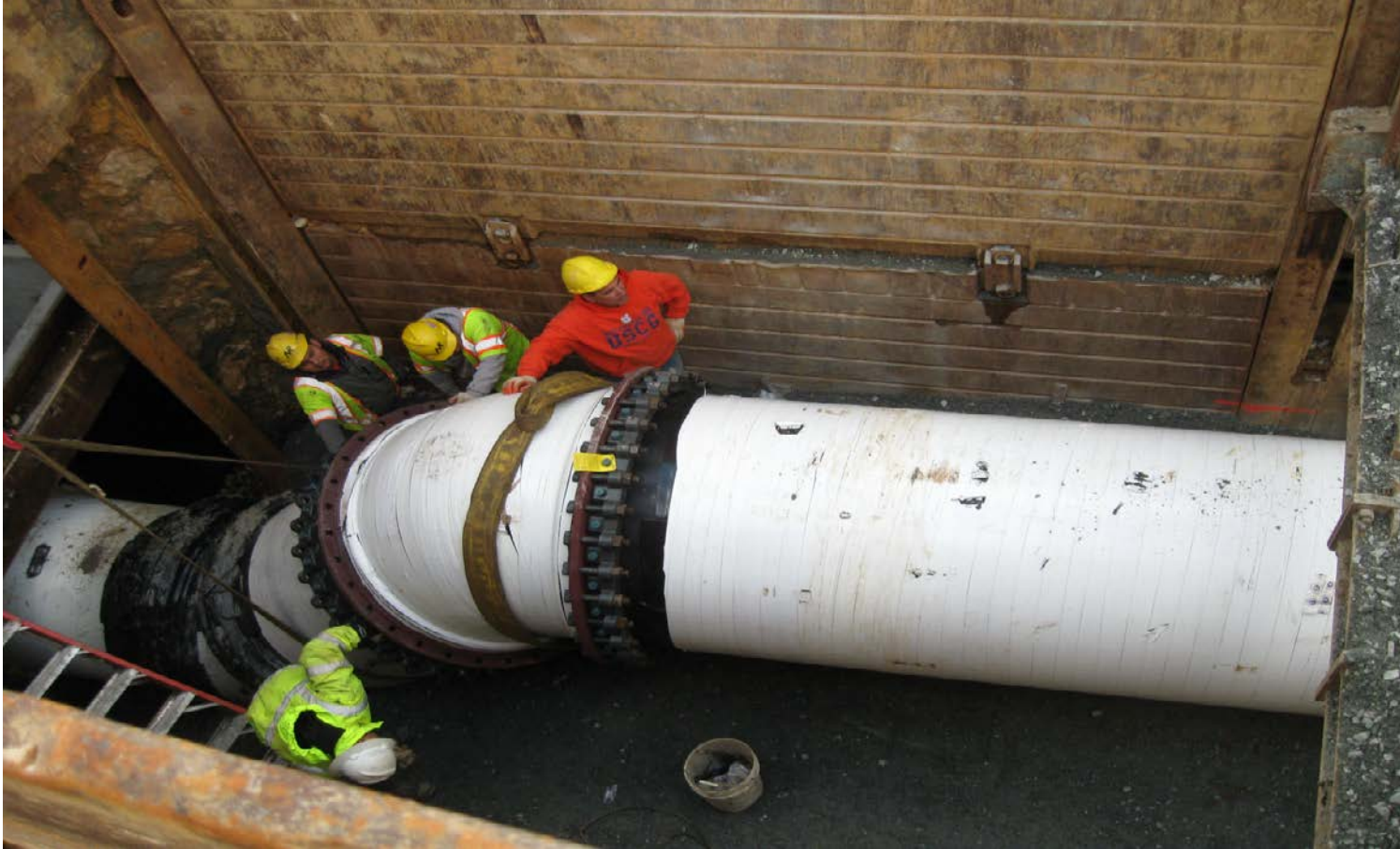
Installing bend and final pipe