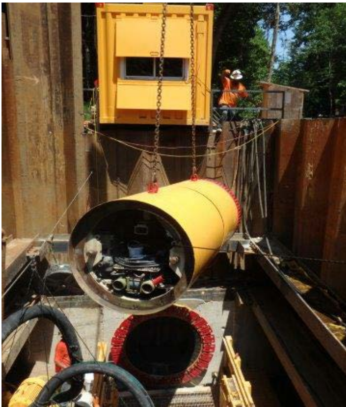
MTBM being set in shaft

Construction is ongoing on this contract.