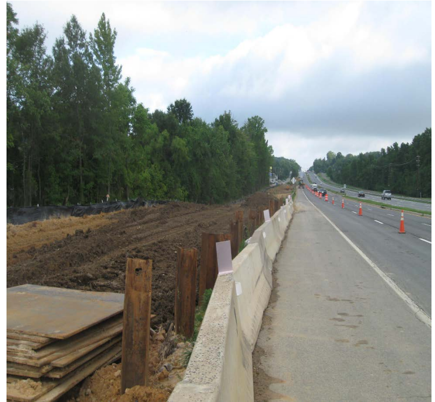
Deep Trench Installation along MD 210