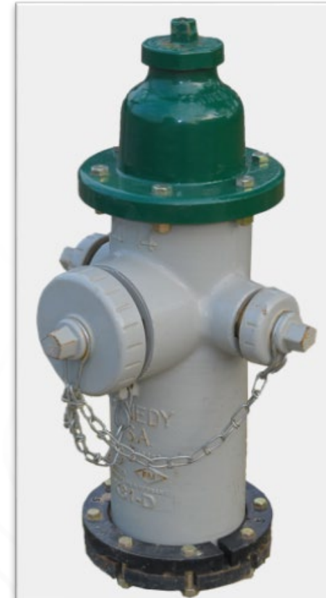
WSSC Water fire hydrants have dark green top and gray body.