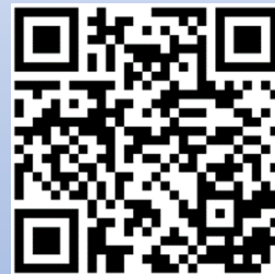
Sleep Charge Assessment

Everyone deserves good quality sleep for the best chance at optimal health. SleepCharge will help you with the best therapies, medical resources, sleep education and care managers. Take the assessment today at sleepcharge.com/wsscmylife OR scan the QR code below. Call 1-877- 615-7257 to learn more.