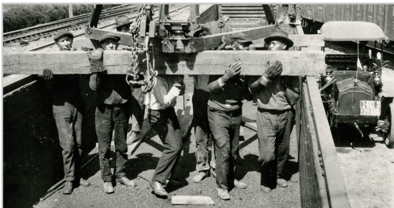
WSSC crews position a crane to unload cast iron pipe from the railroad car (1921).

Visit wsscwater.com/100 for the year-long events calendar