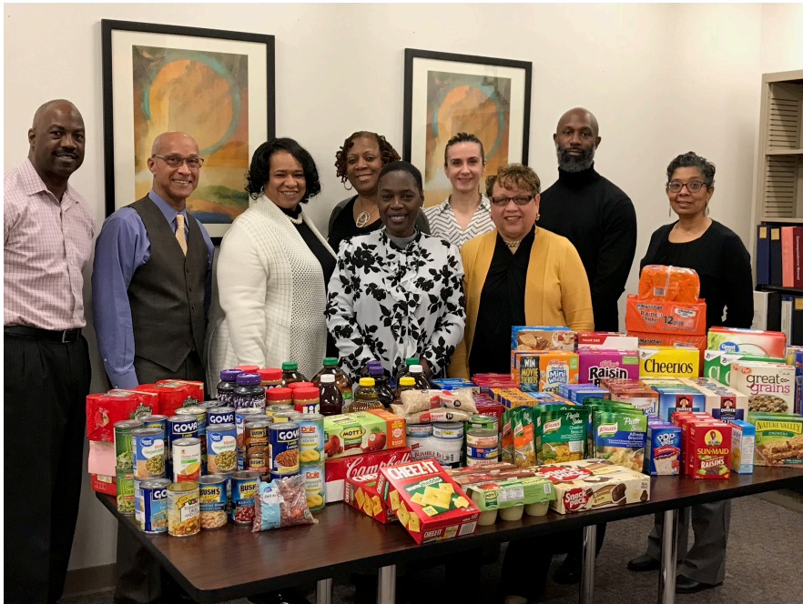
294 items weighing 237.67 lbs.