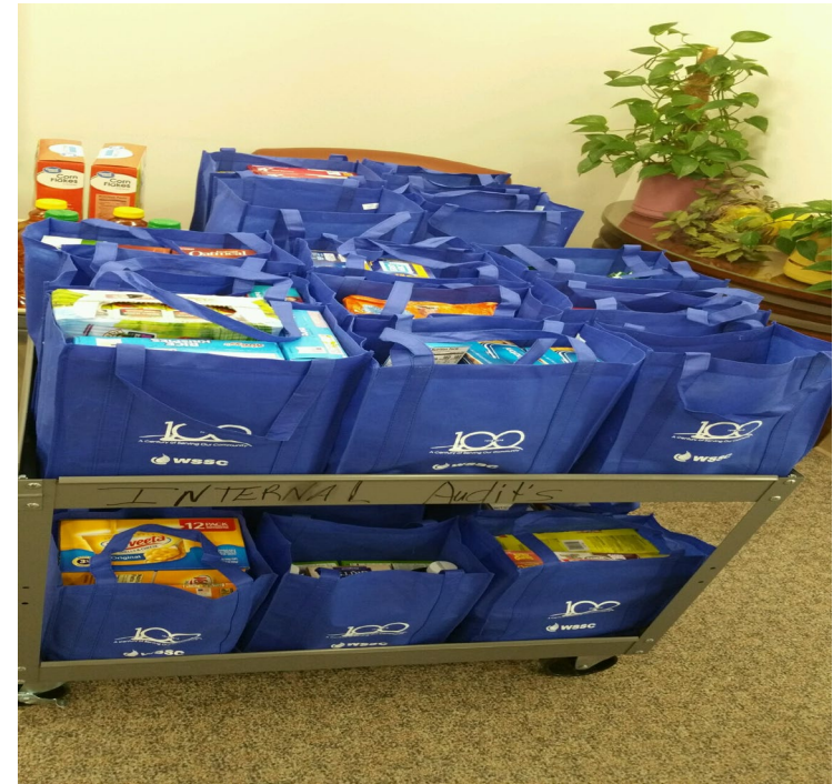
16 bags plus additional items