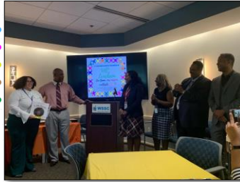
IT Governance “WE” Luncheon