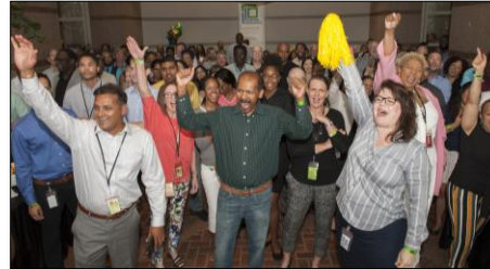
Project Cornerstone “Go Live” Pep Rally