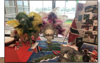
IT International Day